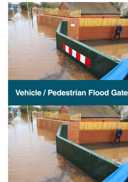
Vehicle / Pedestrian Flood Gate