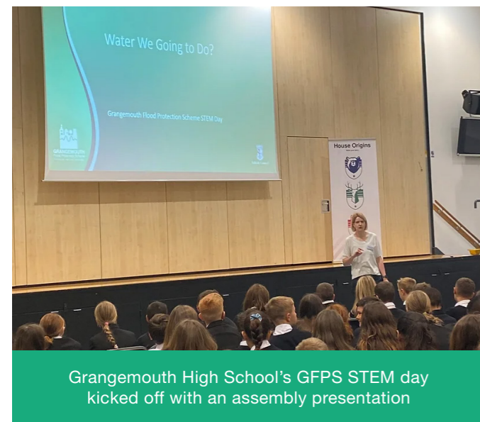
Grangemouth High School's GFPS STEM day kicked off with an assembly presentation

Throughout the day, students took part in five skills-based workshops centred around creativity, communication, collaboration, complex problem-solving and critical thinking. They also had the opportunity to hear from industry experts including archaeologists, engineers, environmental scientists, project managers and stakeholder engagement officers.