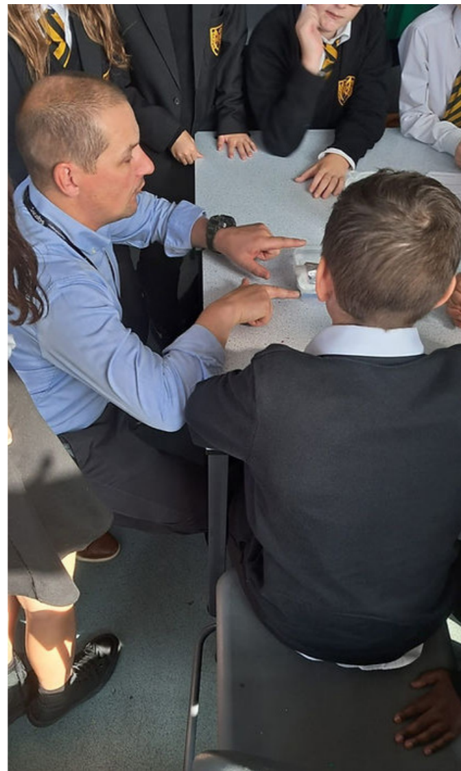
Pupils at Grangemouth High School sparked their creativity with the GFPS STEM activity